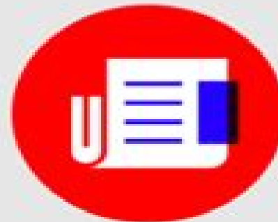
Current Events Content