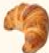
Croissant (Buttered bread)