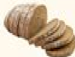
Brown bread (Whole wheat bread)