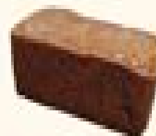
Malt loaf (Barley bread)