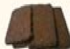
Pumpernickel (Rye bread)