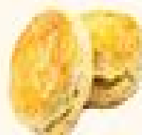
Scone (Quick bread)