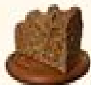
Seven grain bread (multi-grain bread)