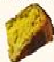
Southern Cornbread (Cornbread)