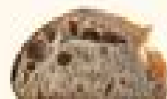
San Francisco Bread (Sourdough bread)