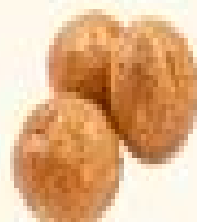
European Bread Roll (Buns)