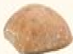
Ciabatta (White bread)