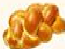
Challah (Leavened bread)