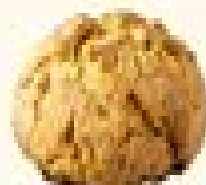
Irish Soda Bread (Soda Bread)