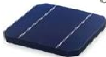
Célula fotovoltaica o celda solar