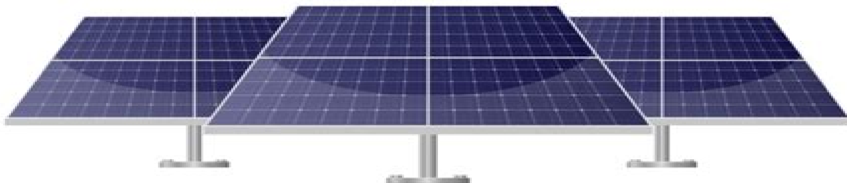
PLANTA FOTOVOLTAICA (Varios paneles unidos)