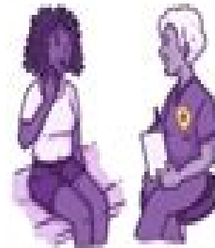
PRIMARY CARE NURSING