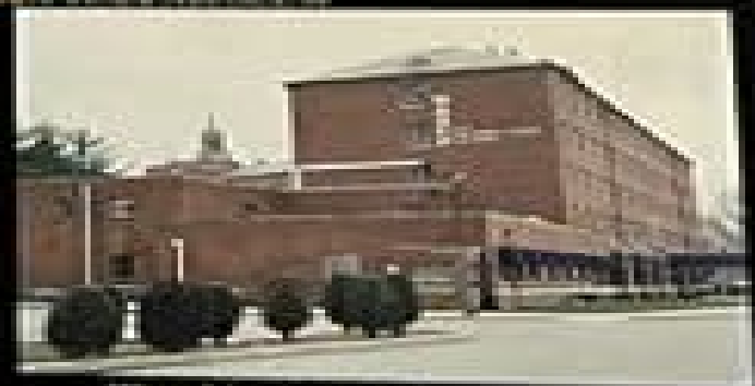
THE NAACP HEADQUARTERS