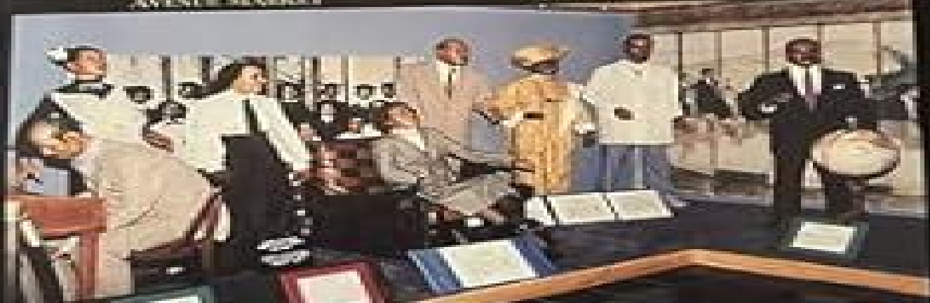
THE GREAT BLACKS IN WAX MUSEUM