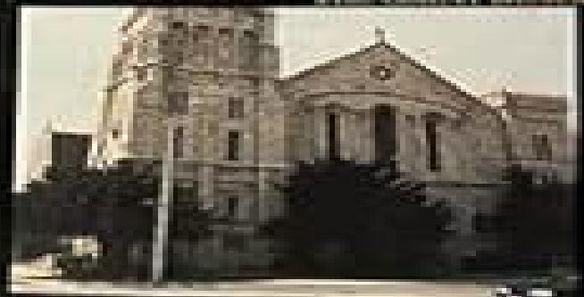
BETHEL A.M.E. CHURCH