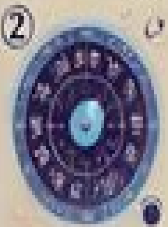
2 Enter your birth time