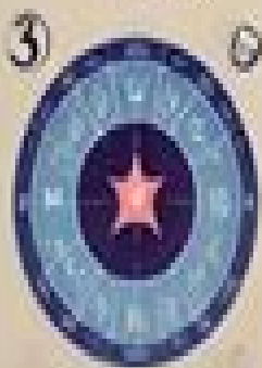
3 Use an online Rising Sign calculator