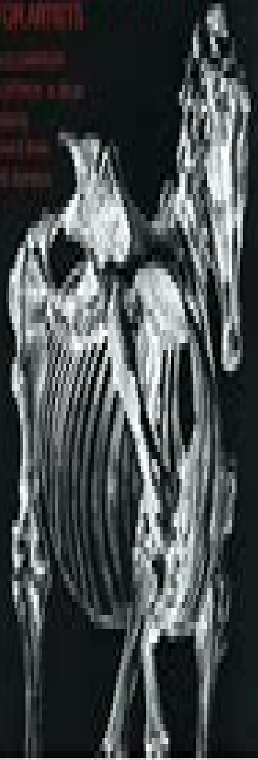
FIG. 100. Dog.

ANATOMY OF THE ANIMAL ANATOMY FOR ANIMALS