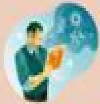
Become a Subject matter expert