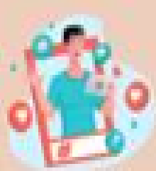
Become an Influencer