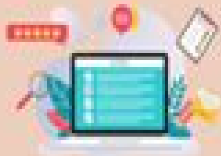
Fill Online Surveys