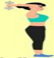
Dumbbell triceps extensions