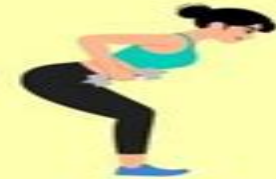
Bent-over dumbbell rows