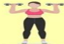
Standing dumbbell overhead press