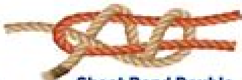
Sheet Bend Double