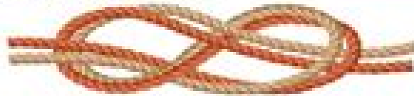
Figure Eight Double