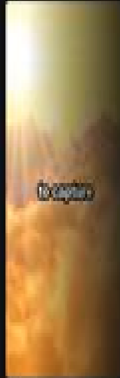
to capture a