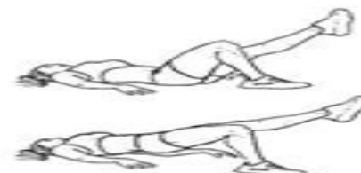
Single Leg Hip Raises