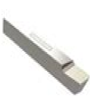
Single Point Tool