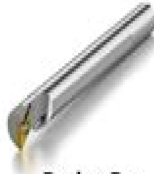
Boring Bar Tool