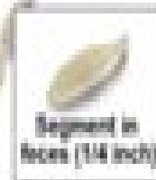
Segment in focus (1/16 inch)