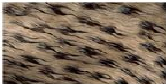
Wet cheetah fur