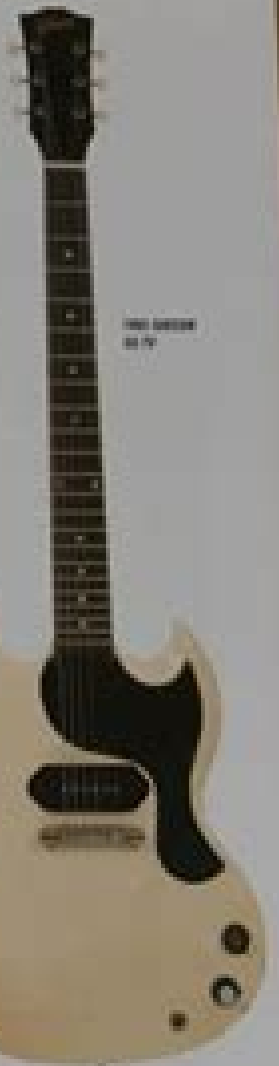
1958 GIBSON SG TV

Gibson's Kalamazoo factory only had a busy year in 1950 as the company stopped the longtime Les Paul models and created a completely new design. This fresh style, which we now know as the SG, first appeared on the Les Paul Standard line that year, and more generally in 1951 on the Les Paul Custom, the SG Special (later), the Les Paul Junior (and the SG TV right). The model names changed from Les Paul to SG