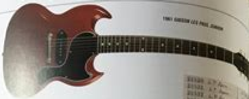
1951 GIBSON LES PAUL JUNIOR