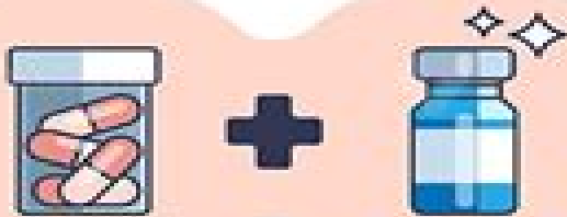
DRUG - DRUG INTERACTION