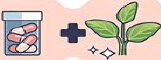
DRUG - HERB INTERACTION