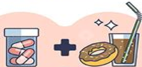
DRUG - FOOD INTERACTION