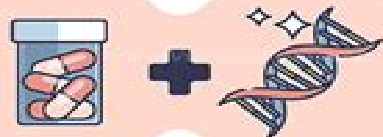
DRUG - GENE INTERACTION