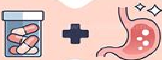
DRUG - ALLERGY INTERACTION