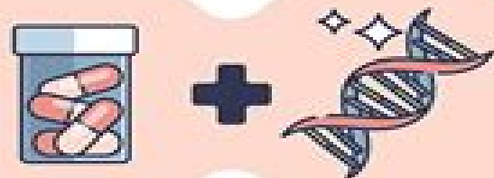
DRUG - GENE INTERACTION