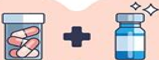
DRUG - DRUG INTERACTION