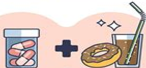
DRUG - FOOD INTERACTION