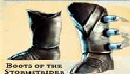
BOOTS OF THE STORMSTRIDER