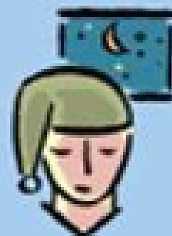
Increased urination at night