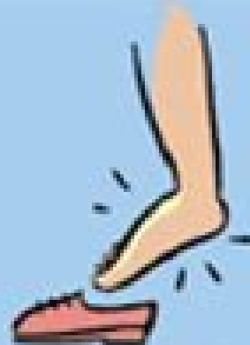
Swelling of feet & legs