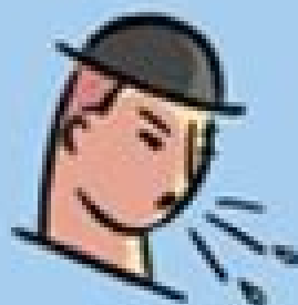
Cough with frothy sputum