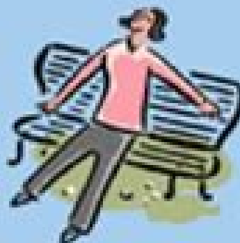
Chronic lack of energy