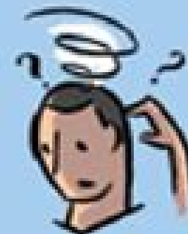
Confusion and/or impaired memory