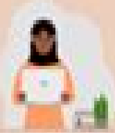
Sell an online course