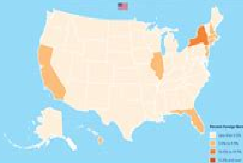
TOP TEN LARGEST U.S. IMMIGRANT GROUPS