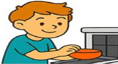
HELPING WITH CHORES