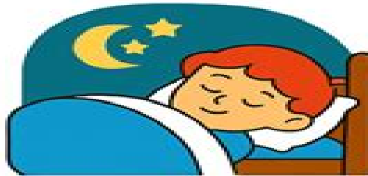
GOING TO BED EARLY