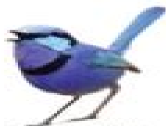
Splendid Fairy Wren