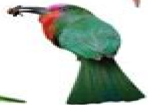
Red-bearded Bee Eater