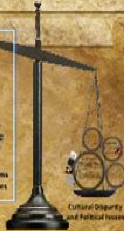
Cultural Disparity and Political Issues