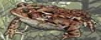
AMERICAN TOAD Anaxyrus americanus