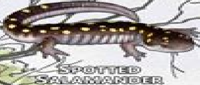
SPOTTED SALAMANDER Ambystoma maculatum