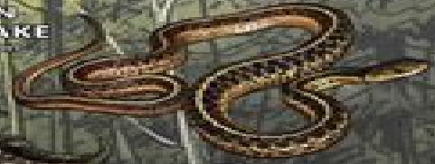
COMMON GARTER SNAKE Thamnophis sirtalis