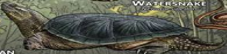
COMMON SNAPPING TURTLE Chelydra serpentina