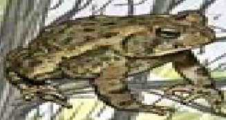
FOWLER'S TOAD Bombina orientalis