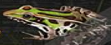
SOUTHERN LEOPARD FROG Lithobates sphenoccephalus