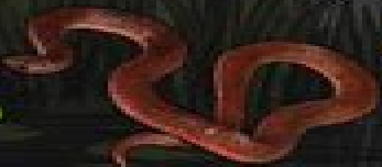
COMMON WORM SNAKE Carphophis amoenus