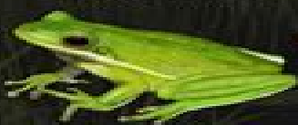
AMERICAN GREEN TREE FROG Hyla cinerea