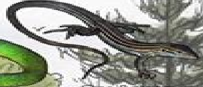
SIX-LINED RACERUNNER Amphispemolon vittatum