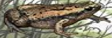
EASTERN NARROW-MOUTHED TOAD Gastrophryne olivacea