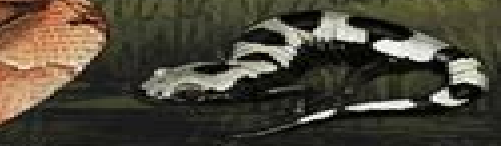
MARBLED SALAMANDER Ambystoma opacum