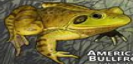
AMERICAN BULLFROG Lithobates catesbeianus