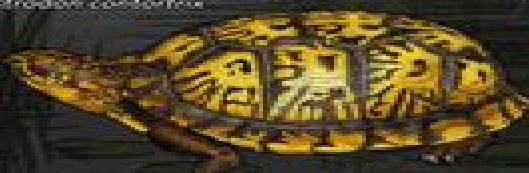
COMMON BOX TURTLE Terrapene carolina