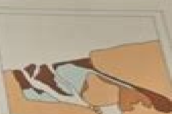
3. Finally the process... the fossil remains... the fossil remains... the fossil remains...

Sediment - a type of limestone Trilobite - a hard limestone Old American fossil shell and rock pieces Trilobite remains