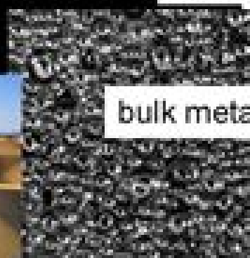
bulk metallic glass