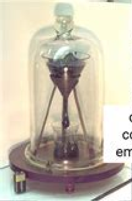
dense colloids/ emulsions