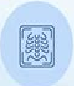
Electronic Health Records (EHR)