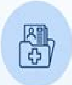
Electronic Medical Records (EMR)