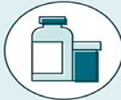
Administration of medication