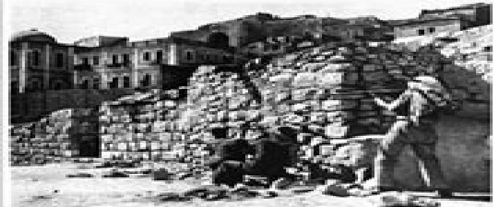
The Arab Legion besieging the Jewish Quarter of Jerusalem, May 1948.