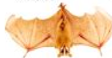
Masked Flying Fox