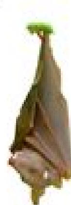
Epouletted Fruit Bat