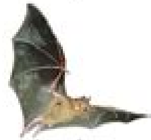
Jamaican Fruit Bat