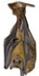
Egyptian Fruit Bat