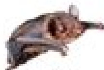
Greater Bamboo Bat