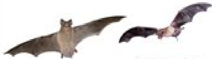
Big Brown Bat