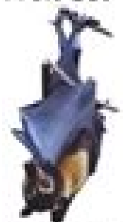
Spectacled Flying Fox