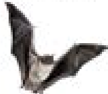
Little Brown Bat