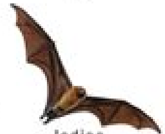
Indian Flying Fox