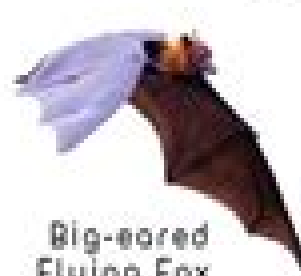
Big-eared Flying Fox