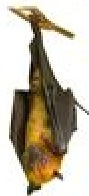
Giant Golden-crowned Flying Fox