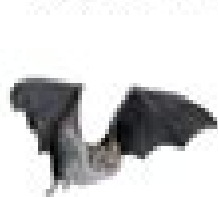
Common Vampire Bat