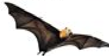
Australian Gray-headed Flying Fox