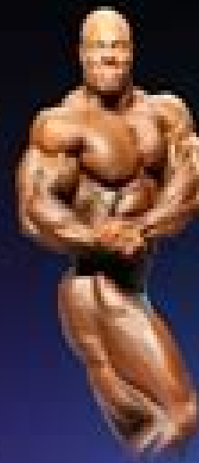
POSE #3: SIDE CHEST POSE