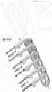
3 phase AC produced in a power station

Three phase alternating current (AC) is made up of three sine waves that are out of phase by 120 degrees. This means that at any given time, one phase is at a peak, one is at a zero, and one is at a trough. This is why three phase systems are used for power distribution in factories and large buildings. They are more efficient and can carry more power than single phase systems.