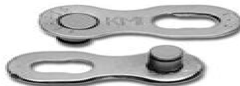
MASTER CHAIN LINK