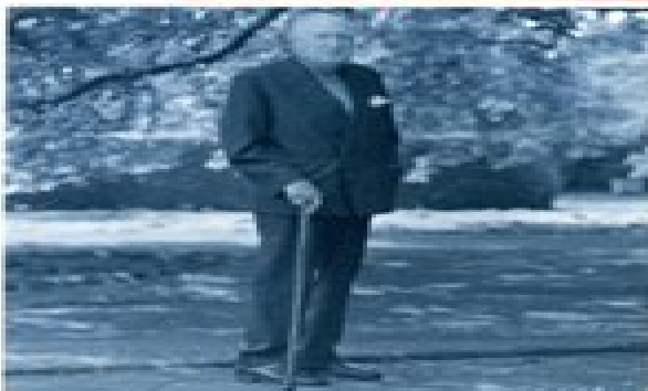
CHANDOS RECORDS LTD. Guthrie - Stone - England