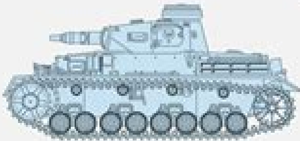
Pz. IV Ausf. D

75-mm gun (later a long-barrel 75-mm) 7.92-mm coaxial machine gun 7.92-mm bow machine gun