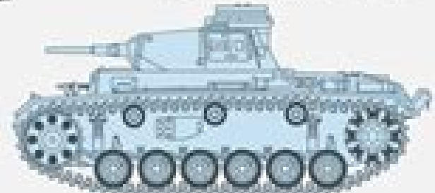
Pz. III Ausf. F

37-mm gun (later 50-mm) 7.92-mm coaxial machine gun 7.92-mm bow machine gun