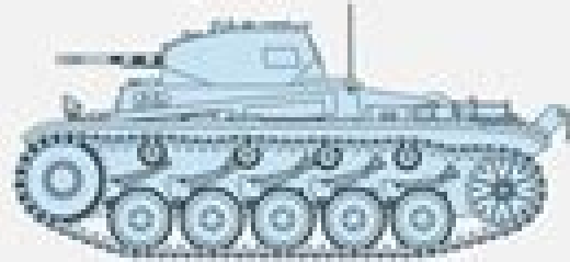
Pz. II Ausf. F

88-mm gun 7.92-mm coaxial machine gun 7.92-mm bow machine gun