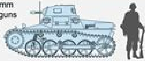
Pz. I Ausf. A

37-mm gun (later 50-mm) 7.92-mm coaxial machine gun 7.92-mm bow machine gun