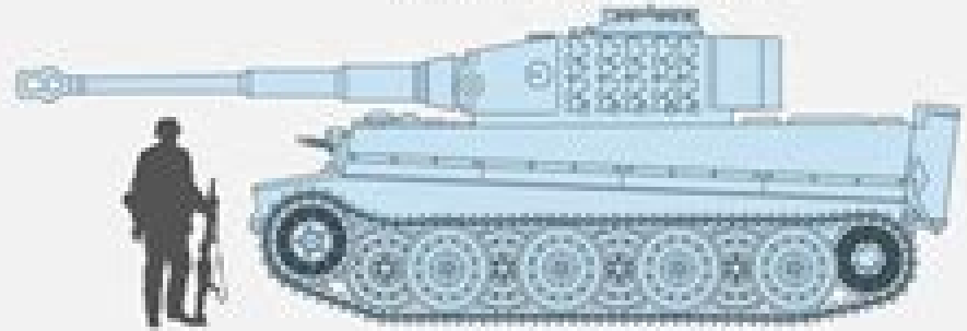
Pz. VI Tiger I Ausf. E

88-mm gun 7.92-mm coaxial machine gun 7.92-mm bow machine gun