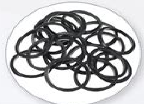
30PCS Sufficient quantity