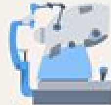
Optical coherence tomography