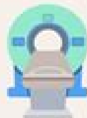
Magnetic resonance imaging