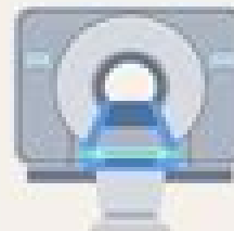
X-ray computed tomography