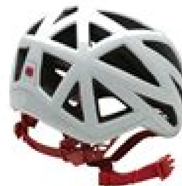
Helmet - UIAA tested