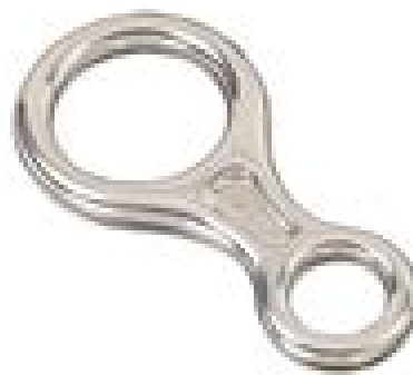
Descender (figure of 8)