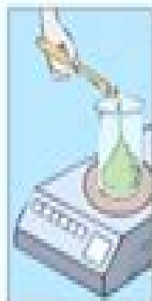
(a) Weighing the sample to be analysed