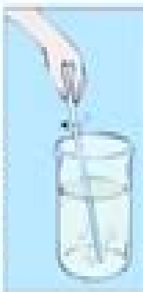
(b) Dissolving the sample in water