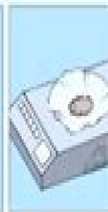
(e) Repeated drying and weighing until a constant mass of precipitate is obtained