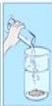
(c) Adding a suitable chemical to form a precipitate