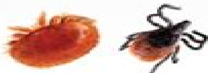
Mites and Ticks (Parasitiformes)