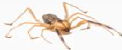
Camel spiders (Solifugae)