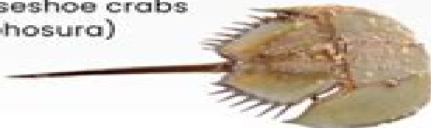
Horseshoe crabs (Xiphosura)