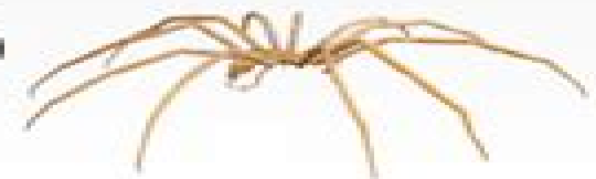
Sea spiders (Pantopoda)