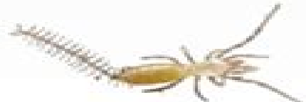
Micro whipscorpions (Palpigradi)