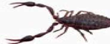
False scorpions (Pseudoscorpiones)